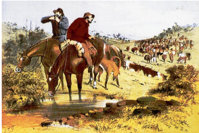
"Overlanders" S. T. Gill C 1880