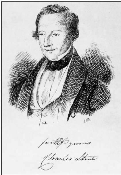
Charles Sturt (Circa 1846)