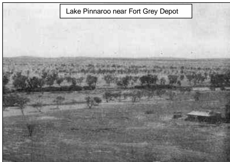
Lake Pinnaroo near Fort Grey Depot

Sturt made three forays from Fort Grey and on the last return on 13 November with Lewis, Flood and Joseph, it was discovered that Harris Browne had pulled the remaining party back to Depot Glen due to lack of good water at the