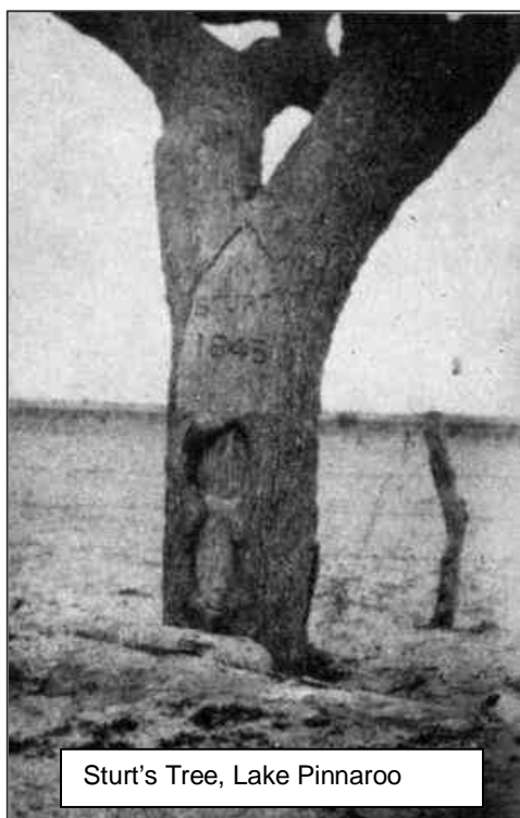
Sturt's Tree, Lake Pinnaroo

"Immediately in front of the tents there was a broad sheet of water shaded by gum-trees, and the low land between this and the sand hills was also chequered with them. The position was in every way eligible. The open grassy field or plain stood full in view, and the men could see the cattle browsing on it."